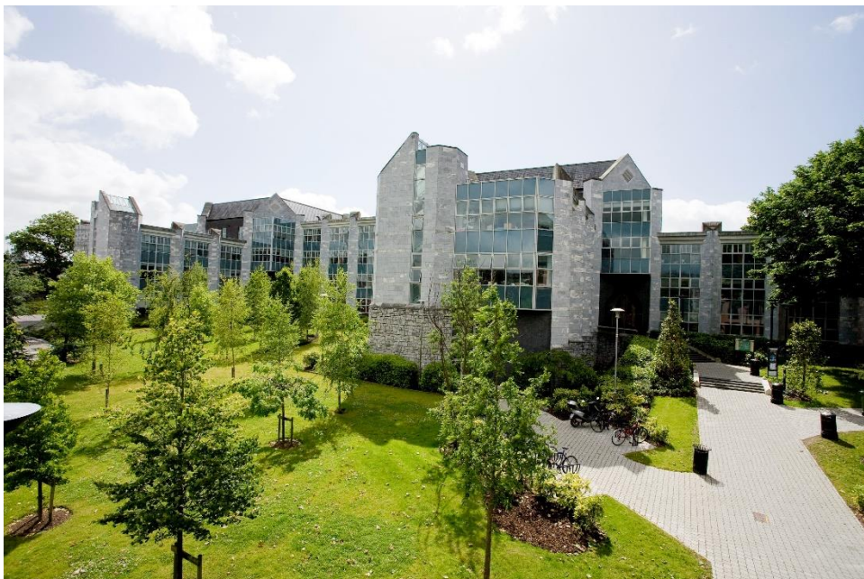
Image of the building is here and a campus map below.

There will also be breakout rooms in both venues but that will be explained when relevant.